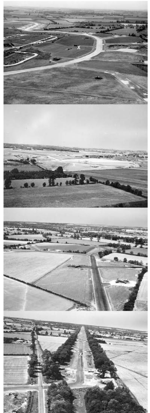
Steve Pena provided the dispersal area photographs in the right column. The top photograph is dispersal area A, followed by dispersal areas B, C, and D.