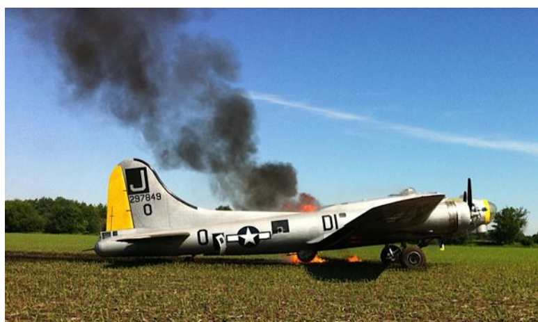
The Liberty Belle after a successful off airport landing in a muddy field due to an engine fire. Unfortunately the mud prevented fire crews access to the bomber which was destroyed as the fire spread throughout the plane.

My job moved to Bakersfield and so the Collings Foundation asked me to host a new stop. The day after I returned from working at the Chino show, I watched the B-17 lumbering in for a landing at Meadows Field Airport. I had a number of veterans in attendance and heard some more experiences. Hats-off to all of you. There was an unexpected interview on TV where I was able to mention the 91st BG quite a bit and those on the Ring may have seen. My two-hour flight (as crew) on 909 was a new experience because of the unusual amounts of rain and storms that California has gotten this year. We flew tucked below the cloud base and above the terrain. The Livermore stop, which I have organized for the past 19 years, was again exceptional with many attendees. 909 and the 91st get a lot of publicity and exposure. We have long lines all day long but also have a number of veterans to pass the time sharing their stories with the crowd. My next flight was a short hop from Livermore to Stockton. I mention one more flight – in the B-24 from Vacaville to Klamath Falls for two hours over spectacular scenery. It was very special because I had a chance to ride in the ball turret for the first time.