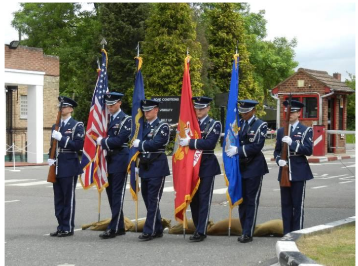
Bassingbourn Prop Memorial Ceremony. Honor Guard (above) and our veterans placing a wreath at the memorial (below).