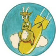
323 rd BS