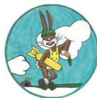
324 th BS