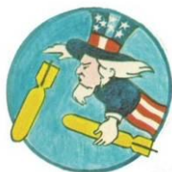
322 nd BS