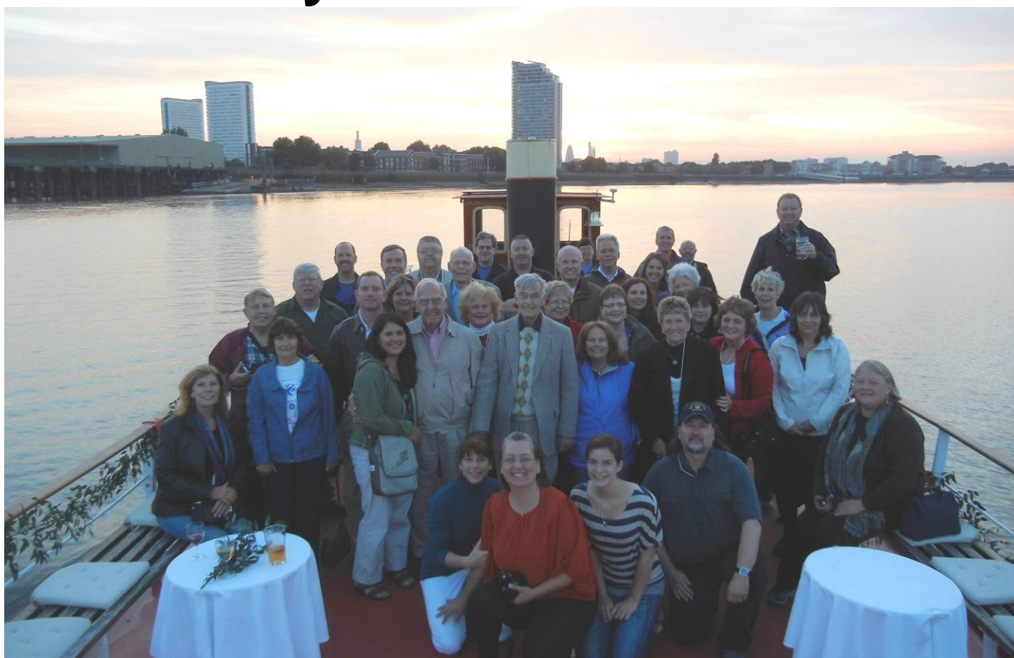
Rally Round participants pose during a Thames River boat tour of London.

As I'm preparing this issue of The Ragged Irregular, I realize two things. The first is this issue is becoming the August, not July, issue and the second is that two months have passed since our group met in the UK! A reminder of how quickly time passes.