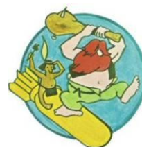
401 st BS