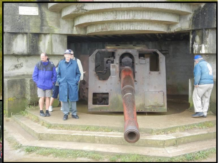
Normandy June 5, 6 & 7