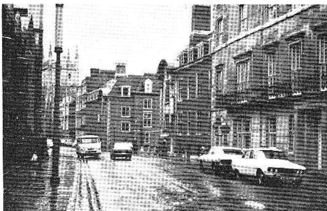
Trumpington Street and The Bull 1974