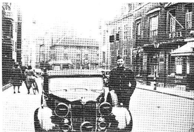
Trumpington Street and The Bull 1944