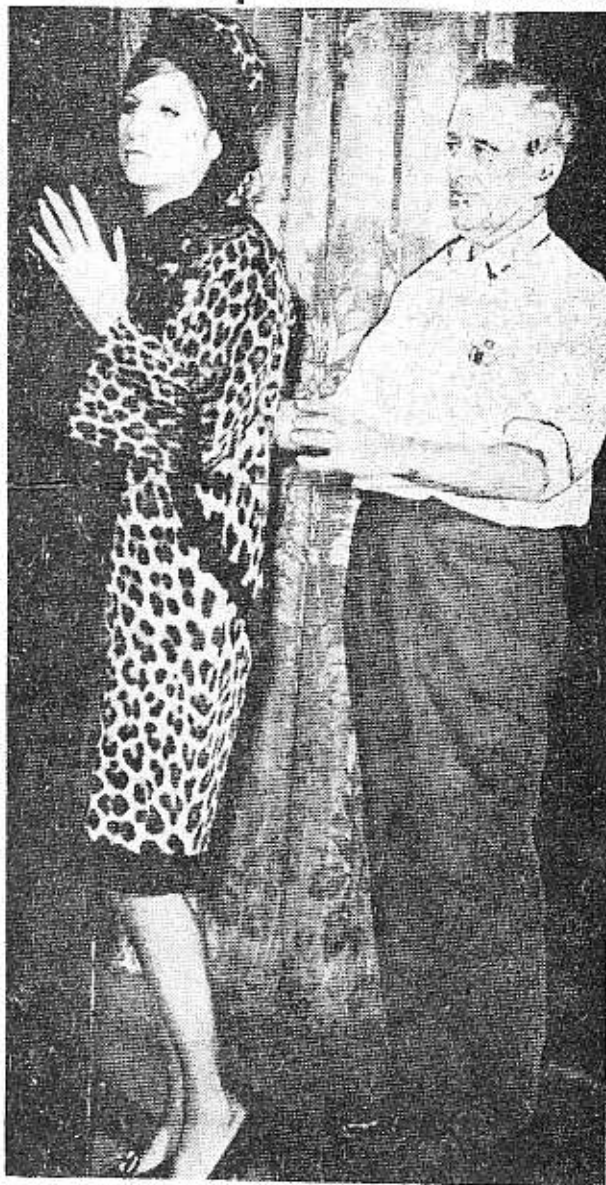
BARBRA STREISAND GETS TIP FROM WILLIAM WYLER

This approach produced some of the most fantastic combat photography ever made, and most of the air-to-air combat scenes in air war movies and television shows since that time were made by the 91st's amateurs.