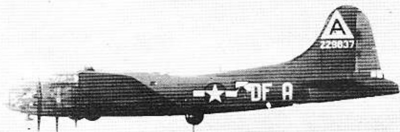
Here's Lady Luck' On The Andres Raid

Our historical records indicate another 91st plane named "Lady Luck," probably with the 322 squadron at a later date than this model, but details are lacking. Information would be appreciated by the editor.