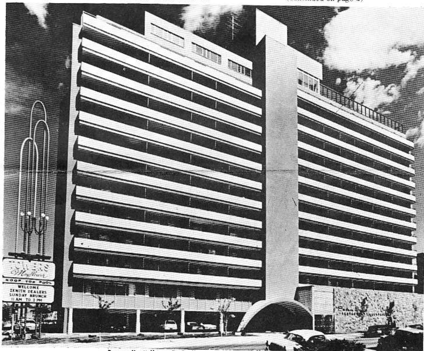
Denver Hyatt House To Be Headquarters For Second National Reunion

At 6:45 Tuesday evening chartered buses will take (continued on page 2)