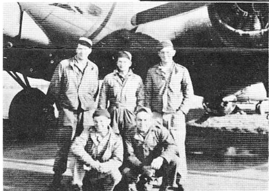
Here are the men who kept the Mouse flying for 139 missions. Unfortunately, our files do not identify them.