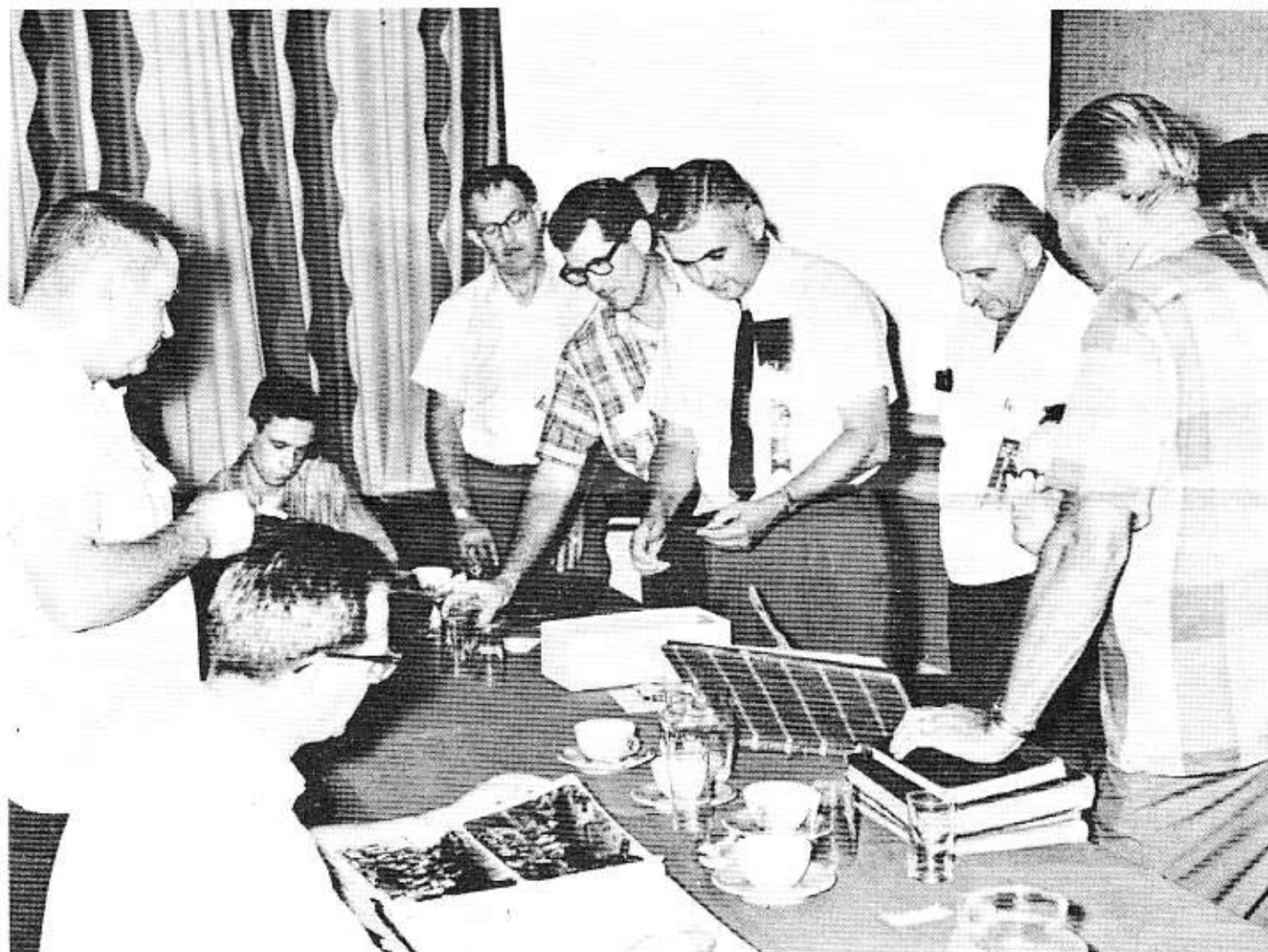
One of the most popular spots at the reunion was the trophy room, filled with photographs, scrapbooks, and mementoes of Bassingbourne days. Here a group looks

over a bit of the collection while enjoying coffee and sweets.