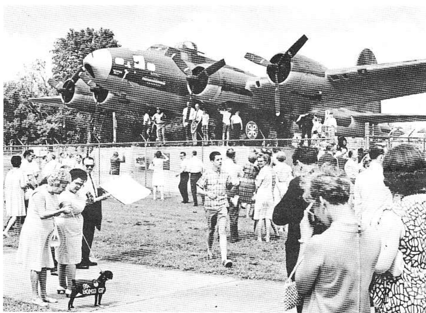
Here members are getting a first hand look at one of the last surviving Fortresses of WWII. Parents and child-

ren alike had a ball climbing over, around, and through the plane "like Daddy used to fly."