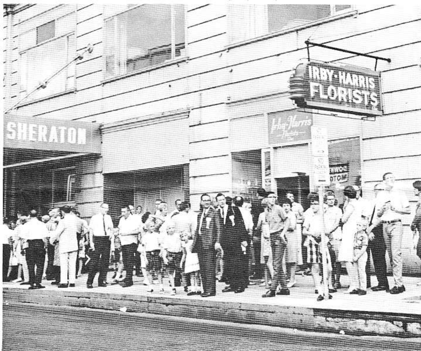
Even after 25 years 91st-ers haven't forgotten how to wait patiently in line. Here a group waits for one of the

Thursday morning, members wound up the reunion with the only business session of the week, laying plans for continued growth of the reborn 91st. Members departed with only one complaint—"We needed one more day to get caught up on 25 years of talk!"